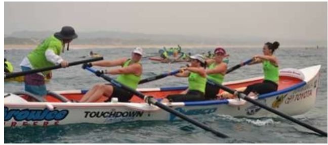
Broulee Wombats at the George Bass Surf Boat Marathon

A season past like no other in living memory, with fires impacting our club events, programs and causing devastation to our district. We had to cancel our Broulee Surfboat carnival in December due to the fires north of the Bay. The George Bass Surfboat marathon was called off after two days of racing into a 7-day race. The Boaties joined other club members to operate the Evacuation Centre at our Surf Club. Just as we get the NSW State Championships completed COVID pandemic cancels all surfboat events for at least 6 months. The Aussies, Worlds in Italy and the South Coast Boat series all cancelled.