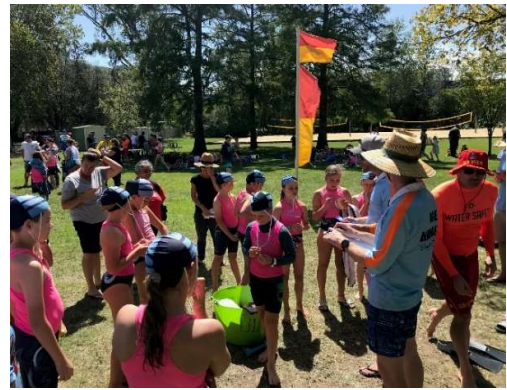
Broulee Canberra Nipper session at the Pool

The season started early with an indoor event in July to test life savers skills in events involving rescuing manikins and live patients using various equipment including rescue tubes, fins and ropes. 10 competitors from Broulee Surfers (including 7 from our Canberra-based nippers and parents) participated in the SLS state pool rescue championships at Woy Woy. The nippers had a great time on the first day of the carnival, with several top 10 finishes. On the second day, the Master's combined to place Broulee Surfers 5th overall after