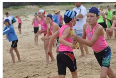
Nipper Relays races are great

A central sandbank flanked by two active rips and a strong current on approach to the swim string kept the swimmers and board riders working hard for the places. A consistent wave over the bank on the mornings rising tide meant some last-minute shuffling of the order of events to allow the battle of the strongest first before the younger guns tackled the swim buoys once the tide changed. Some awesome waves and sets meant glory for some of the paddlers, and sore arms for the others if they missed the set on the way in. The sand events of flags and sprints finished the day after the water events of the morning. Broulee and Canberra Nippers were well represented across all disciplines with 105 competitors competing amongst the age groups.