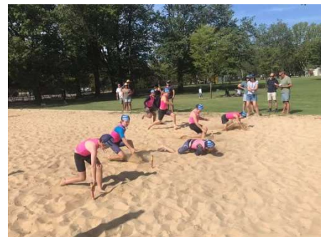
Canberra Nippers doing Beach Flags