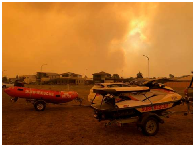
Lifesaving equipment moved away from the fires