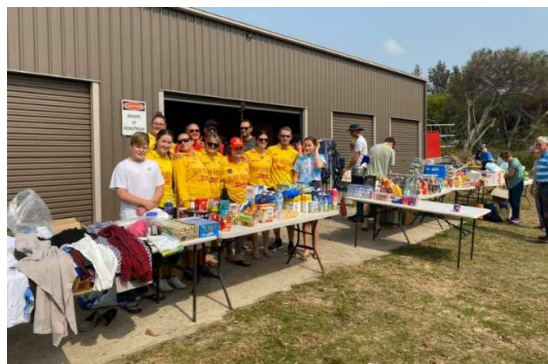
Fire Services team handing out supplies to Broulee community