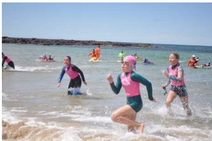
Swim wades are fun but hard work

there is a minimum of one Water Safety person to five Nippers entering the water. Sometimes in poorer conditions ratios of 1-3 or even 1-1 is needed. Thanks John and all those dedicated water safety participants keeping the wheels in motion! Another job well done.