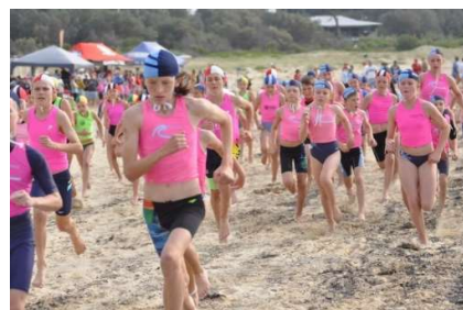
Nippers on the run