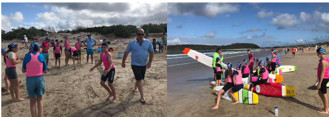
Canberra Day public holiday long weekend nipper training at North Broulee