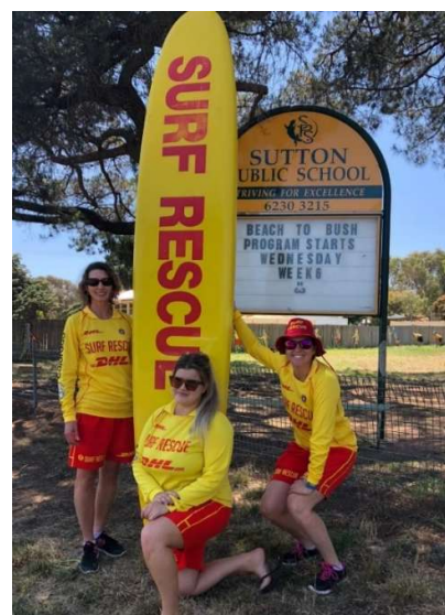
Our Beach to Bush presenters visit Sutton primary