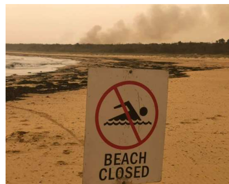
Hopefully, we see no more of this sign next season