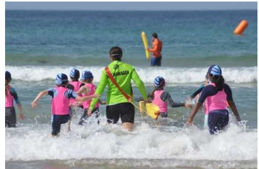
Nipper Water Safety taking care.