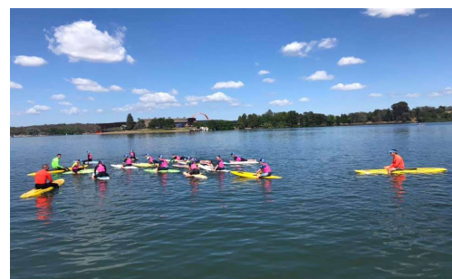
Nippers on Lake Burley Griffin