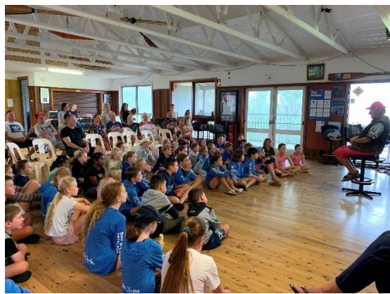
Nippers instruction in the hall