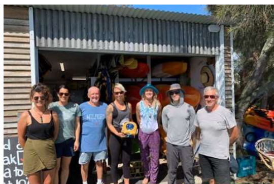
y Point boat ramp shop