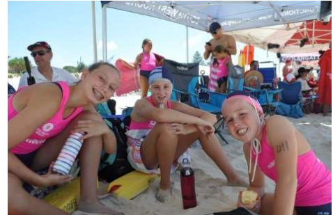
Nippers relax after a hard session