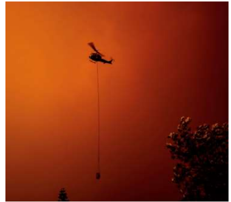
Thank you RFS for your skill and support

At 03:12am on 31 December, FSC21 contacted the Surf Life Saving emergency response system (13SURF) advising the Bega Valley Emergency Operations centre has formally requested Surf Life Saving assistance for fires in the Bega area. An emergency warning was in place for the fire, and warnings have been issued to residents to shelter in place or head east to the beach. Communities that may be impacted include Bermagui, Cuttagee, Berraga Bay with residents advised to head east. Bega ALS lifeguards have been requested to assist with operations. Emergency warning was also been issued for separate Clyde mountain fire advising residents in Mogo area to head east to the beach or shelter in place.