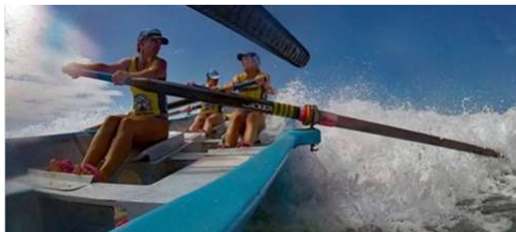
Broulee Capitals in action