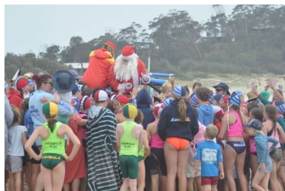
Santa visits the Nippers as they are "good" and "nice"