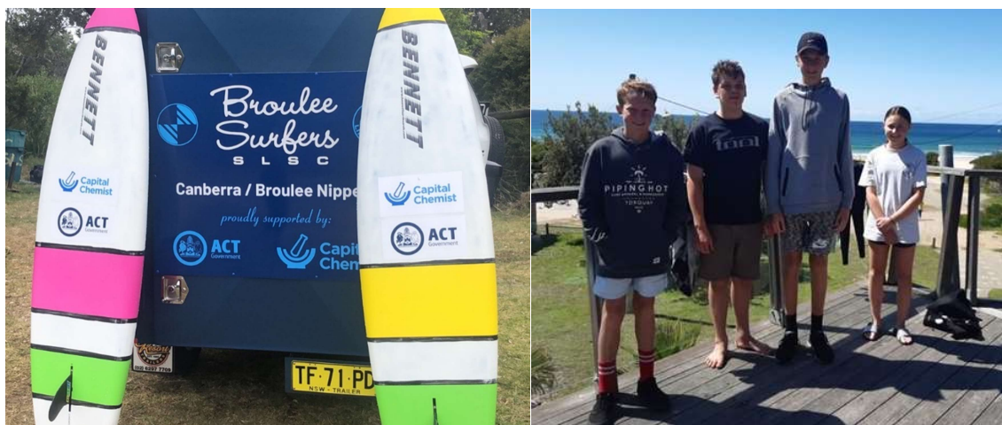
Proud to be Broulee Nippers