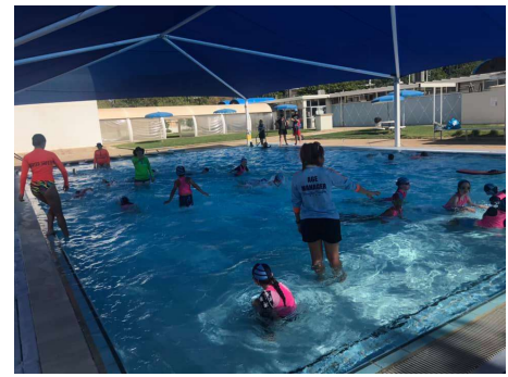
Nippers in the Pool