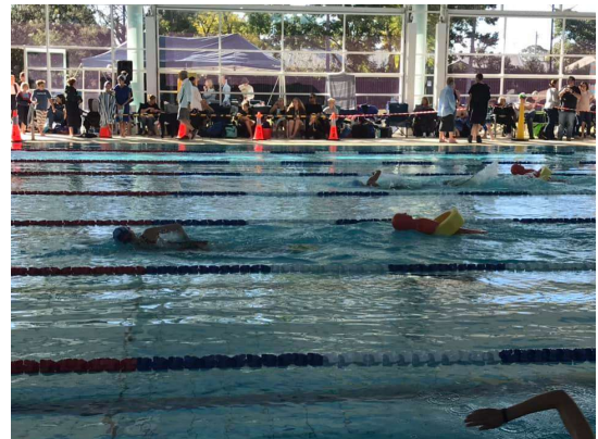
State Pool Championships – Go Broulee