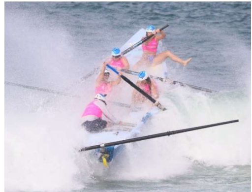
Open Women Surfboat (Wombats) crash a wave