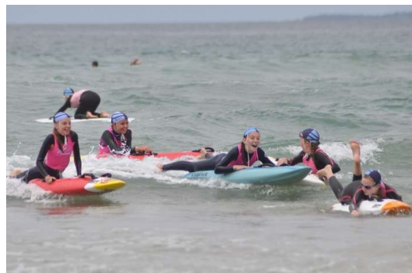
I needed that wave to the beach